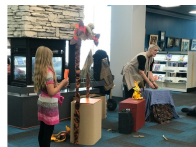
"Why the Rabbits Nose Wiggles" at Crowfoot Library