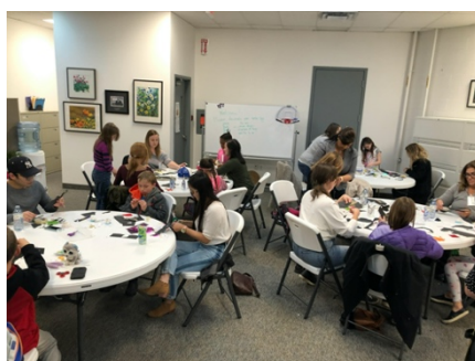
Courage Journey workshop at Big Brother & Sisters