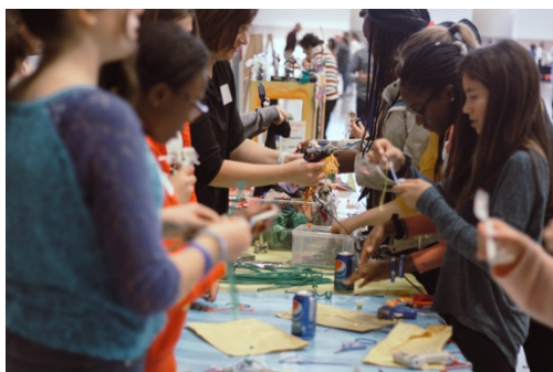
Canadian Mental Health Youth Summit