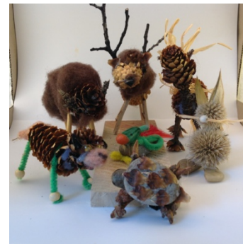
DIY Pop Up for May 2020 - Natural Animals with Blackfoot Translation