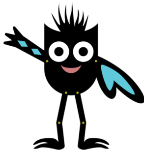
Avatar for Playing with Shadows online course