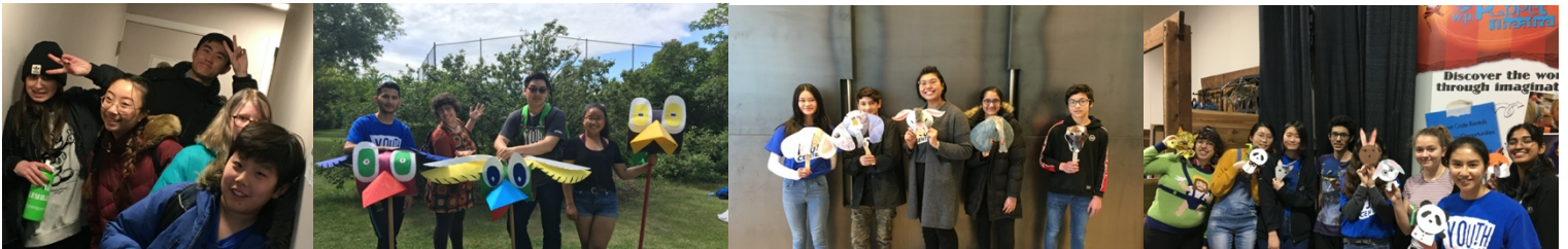
Youth Central Volunteers