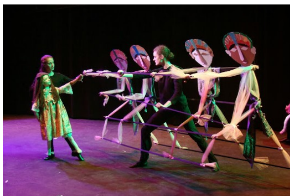
This boosted FB post on April 24, reached 8,319 people

City Hall, 800 Macleod Trail S.E. | Calgary, AB, Canada T2P 2M5 | P.O. Box 2100, Station M, #8069 | Calgary, AB, Canada T2P 2M5 T 403.268.5622 | F 403.268.6130 | themayor@calgary.ca